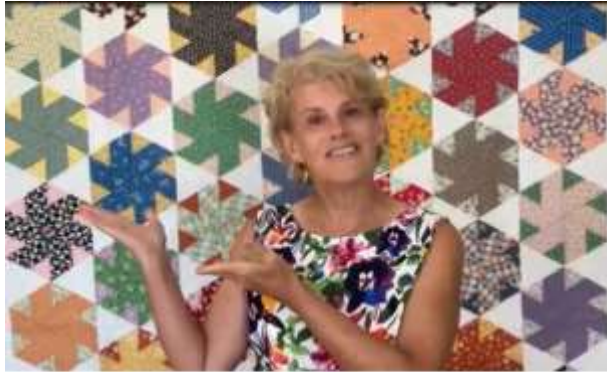
Introduction to my lecture - A Deep Dive into Needles, Thread, Batting and Fabric

There will be a small $15 charge since this is more than just a usual sew-in